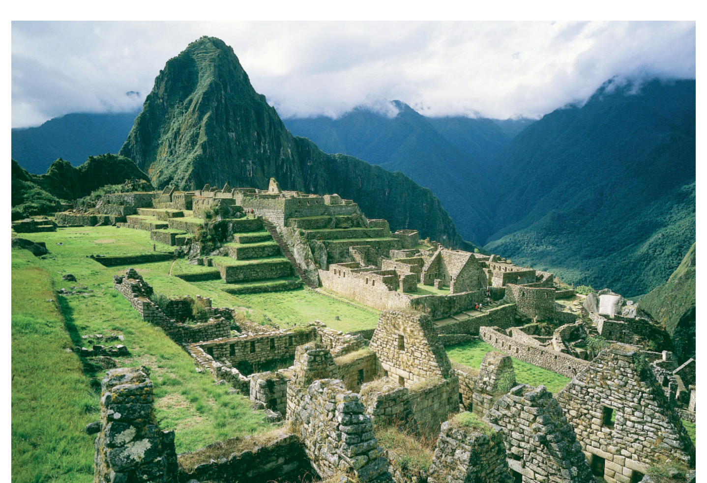
▼ Machu Picchu lies some 8,000 feet above sea level on a ridge between two mountain peaks.

While Cuzco was the religious capital of the Incan Empire, other Incan cities also may have served a ceremonial purpose. For example, Machu Picchu, excavated by Hiram Bingham in 1912, was isolated and mysterious. Like Cuzco, Machu Picchu also had a sun temple, public buildings, and a central plaza. Some sources suggest it was a religious center. Others think it was an estate of Pachacuti. Still others believe it was a retreat for Incan rulers or the nobility.