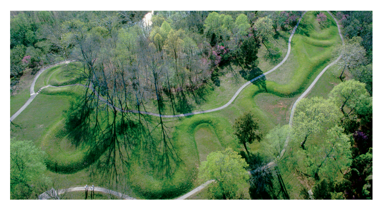
▲ Great Serpent Mound runs some 1,300 feet along its coils and is between 4 and 5 feet high.

people lived at Cahokia (kuh•HOH•kee•uh), the leading site of Mississippian culture. Cahokia was led by priest-rulers, who regulated farming activities. The heart of the community was a 100-foot-high, flat-topped earthen pyramid, which was crowned by a wooden temple.